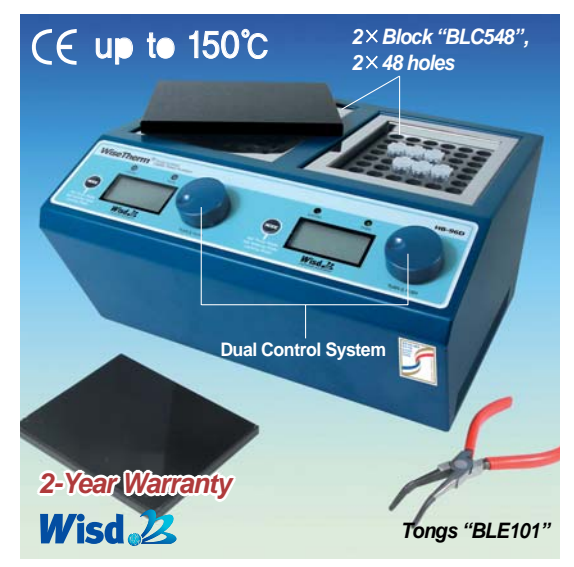
Dry Bath, Heating, Dual Control System "HB-96D-set"

DH.WHB30198 Validation Service(IQ, OQ), "DBV198", for "HB-96D"