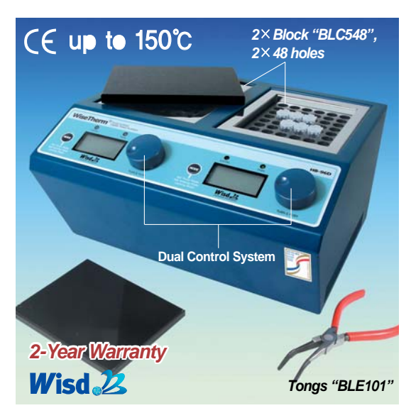
Dry Bath, Heating, Dual Control System "HB-96D-set"

DAIHAN-brand® High-performance Dry Bath, Heating, Dual-type "HB-96D", up to 150^{\circ} C, \pm 0.1^{\circ} C with Digital Fuzzy Control, Molded Heater, Modular Blocks, Acrylic Lid, Touch-button Controller, with Certi. & Traceability